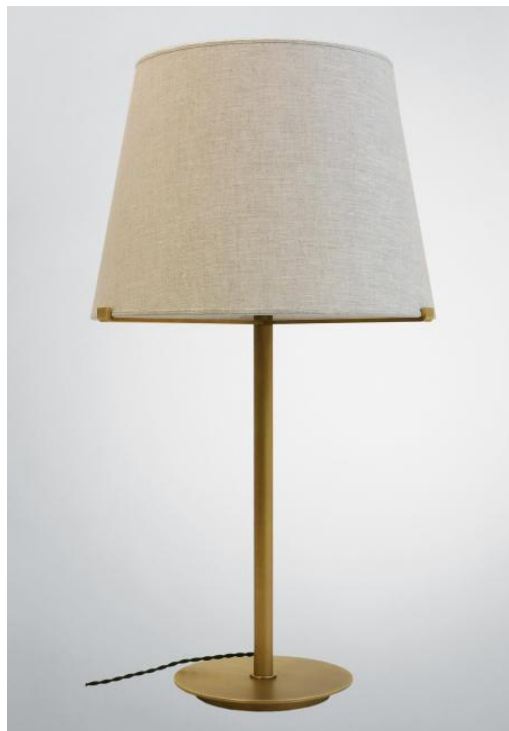
MALMÖ 2 o in light bronze with lampshade in Lin Moscou (fabric from category 2)