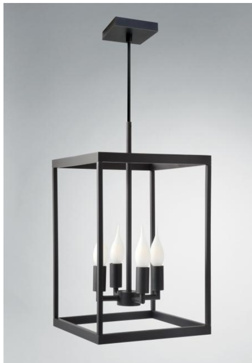
CHAMBORD #27 in brushed bronze. Metal finish code: 29