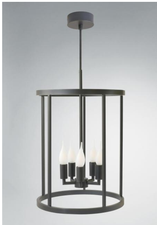
CHAMBORD o35 in brushed bronze. Metal finish code: 29