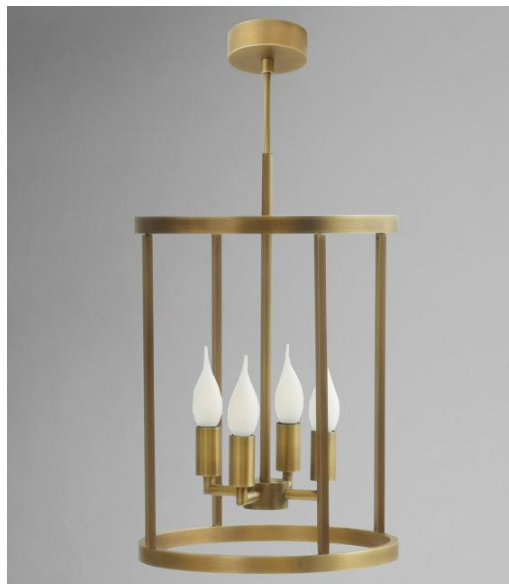
CHAMBORD o30 in light bronze. Metal finish code: 28