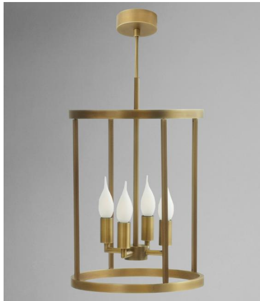
CHAMBORD o30 in light bronze. Metal finish code: 28