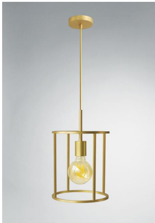
CHAMBORD o22 in brushed brass. Metal finish code: 25