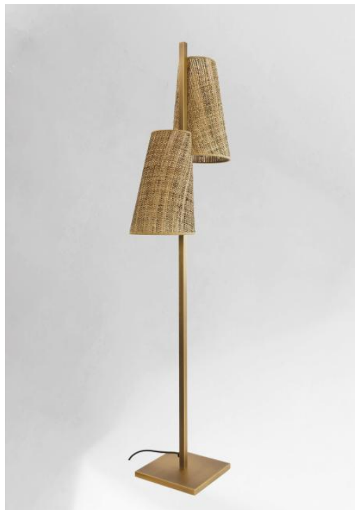
FENICE in light bronze with lampshades in Raphia Banane (material from category 3)