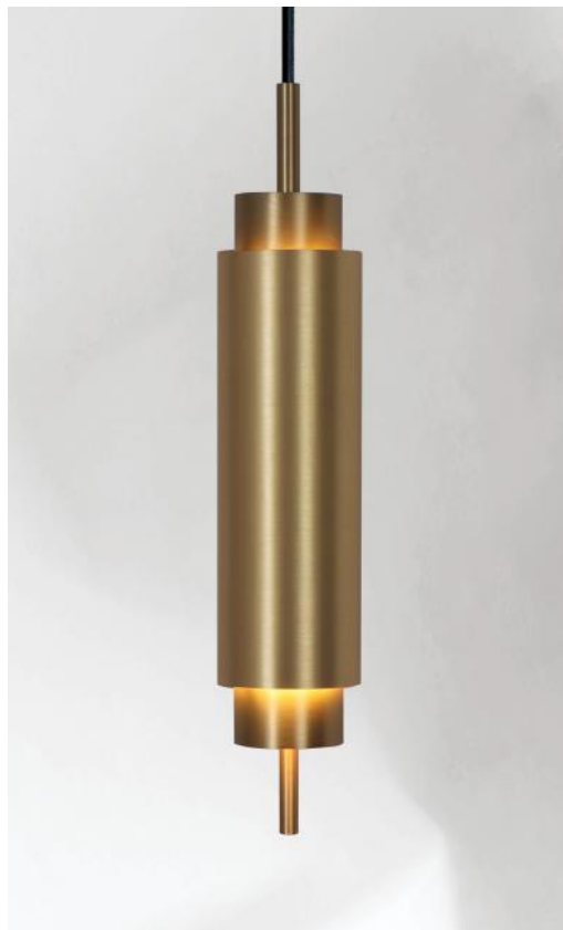
TOKYO suspension in light bronze