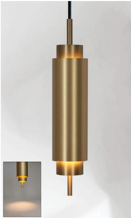
TOKYO suspension in light bronze. Metal finish code: 28