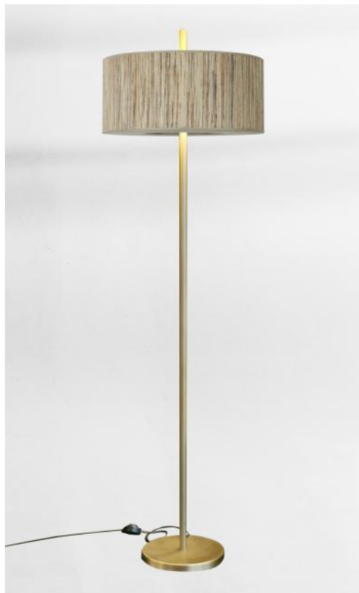
MALLAWI FLOOR in light bronze with lampshade in Jacinthe Naturelle (material from category 5)