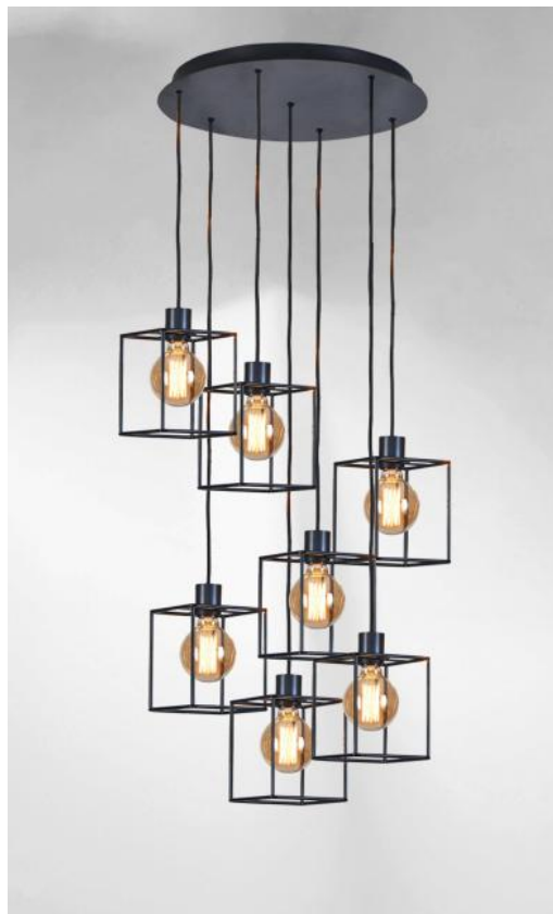
KERMA 7 ø48 in brushed bronze with structures in black epoxy