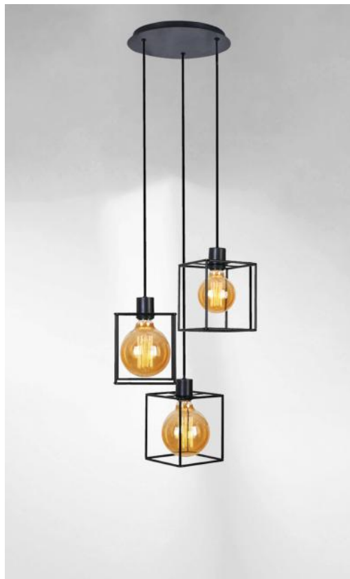
KERMA 3 o26 in brushed bronze with structures in black epoxy