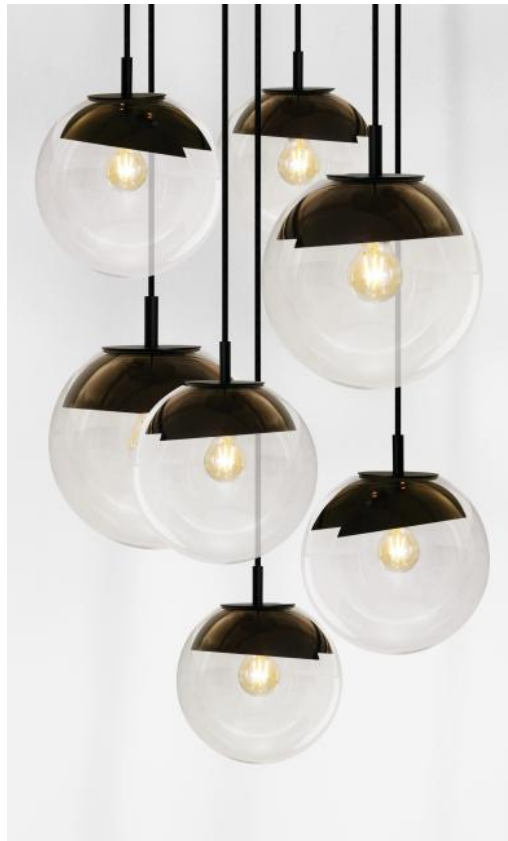
LUNA 7 ø48 in structured black (code 02) +transparent glasses (code 80)