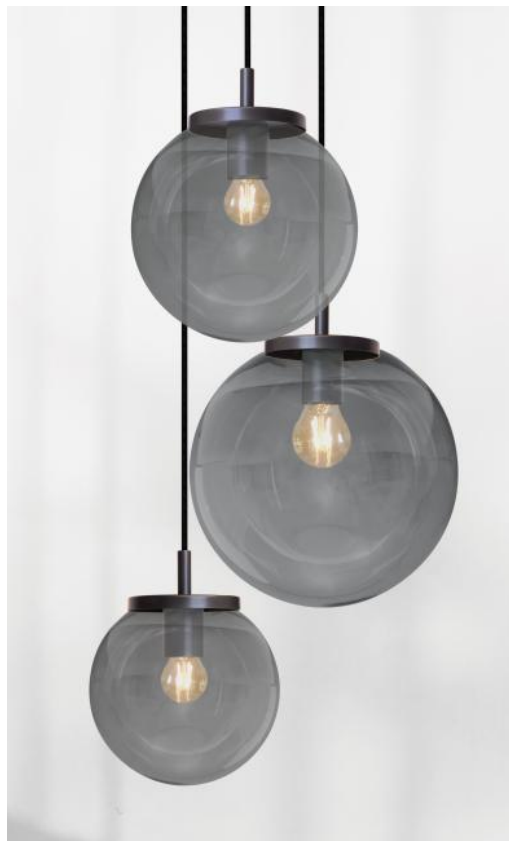
FORYOU 3 o26 in brushed bronze (code 29) with anthracite glasses (code 82)