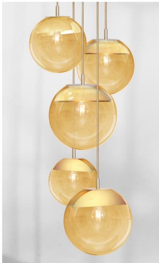
LUNA 5 o33 in brushed brass (code 25) with amber glasses (code 85)