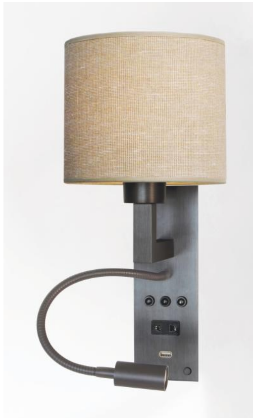
Wall lamp for bedboard in brushed bronze with cilindrical lampshade in Stone Calcite (fabric from category 4)