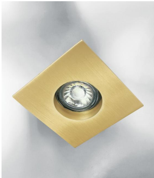
RIVERSIDE 1 in brushed brass. Metal finish code: 25