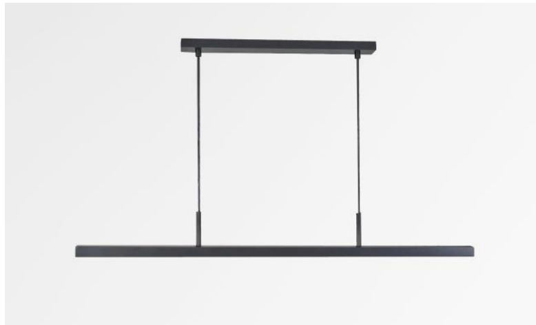
POLARIUS 90 in brushed bronze