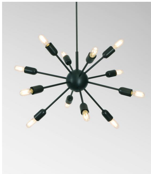
SOLAR 1 in brushed bronze with clear bulbs