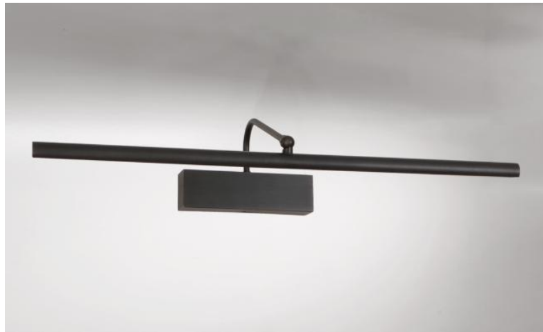
VERSAILLES 55 in brushed bronze. Metal finish code: 29