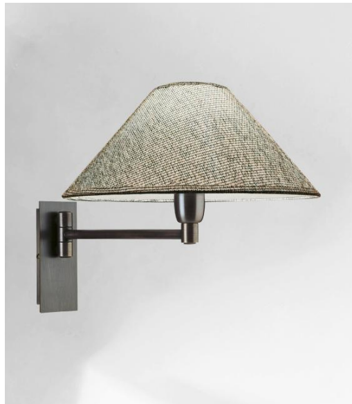
SOKARIS -SW in brushed bronze with lampshade in Esmaria Seigle (fabric from category 3)