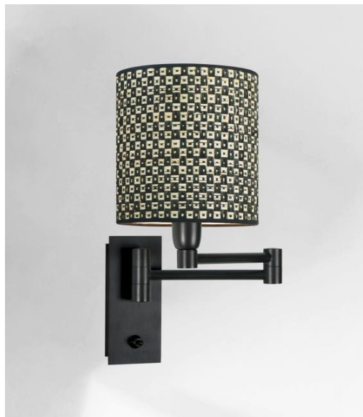
AHMOSIS +SW in brushed bronze with lampshade Palmier Polka (material from category 5)