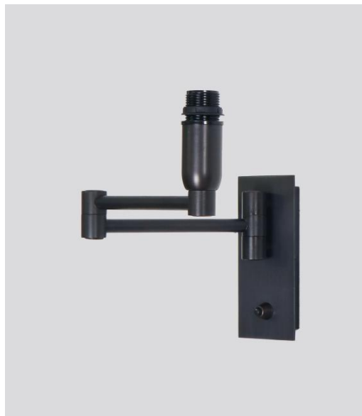
AHMOSIS +SW in brushed bronze without lampshade