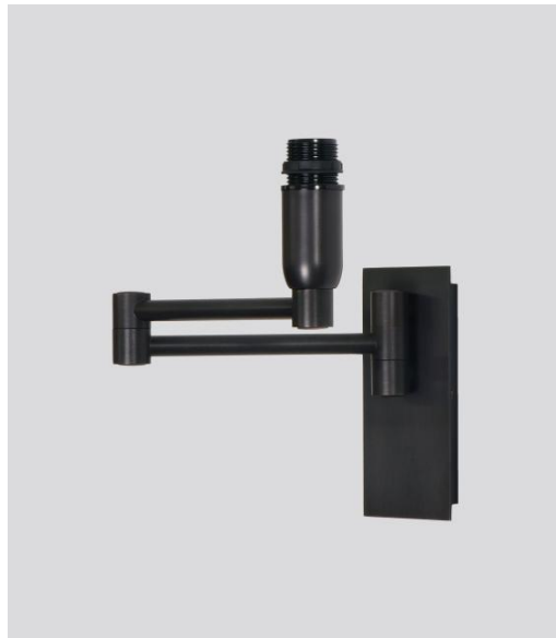
AHMOSIS -SW in brushed bronze without lampshade