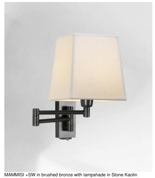
(fabric from category 4)