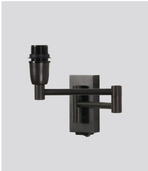
MAMMISI +SW in brushed bronze without lampshade