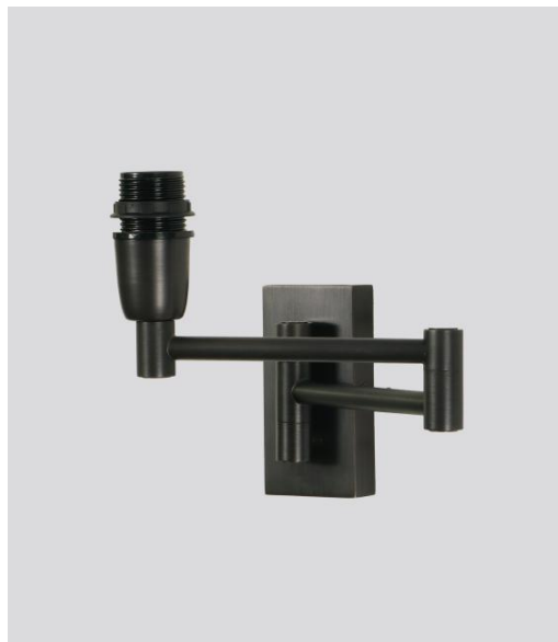
MAMMISI -SW in brushed bronze without lampshade