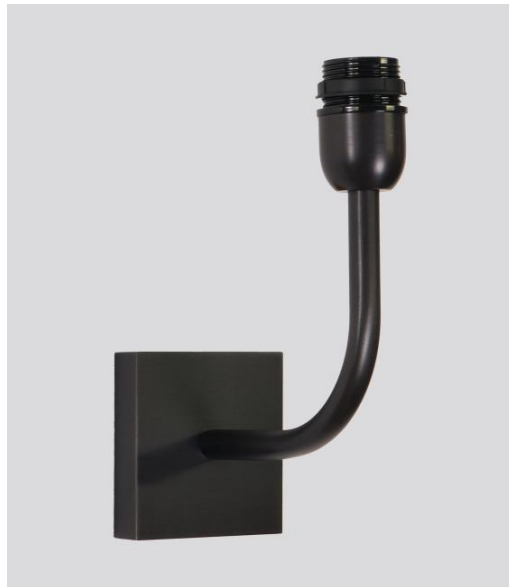
ABA 2 in brushed bronze without lampshade