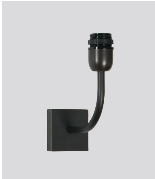
ABA 1 in brushed bronze without lampshade