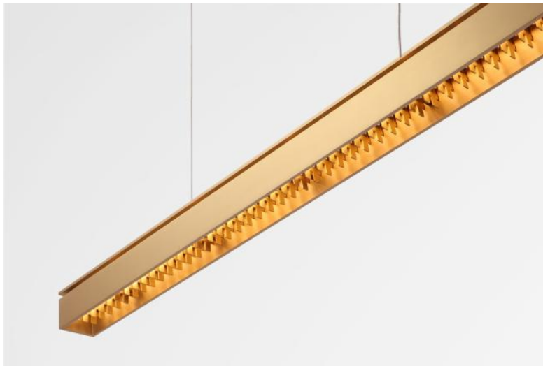
GALAND J # in brushed brass. Metal finish code: 25