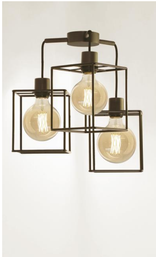
KERMA 3 CEILING in brushed bronze with structures in black epoxy