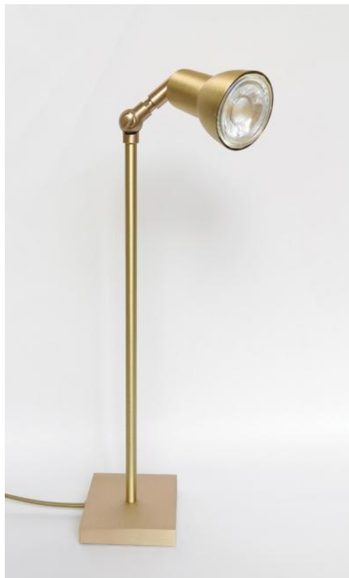
VENATOR 1 in brushed brass. Metal finish code: 25