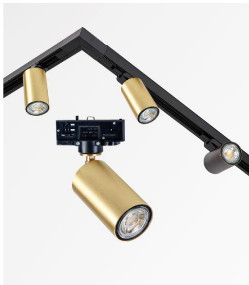
Tracks + DEIMOS SPOTLIGHTS for track in brushed brass and in brushed bronze