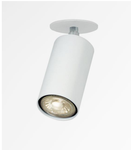
DEIMOS P1 o in structured white. Metal finish code: 01