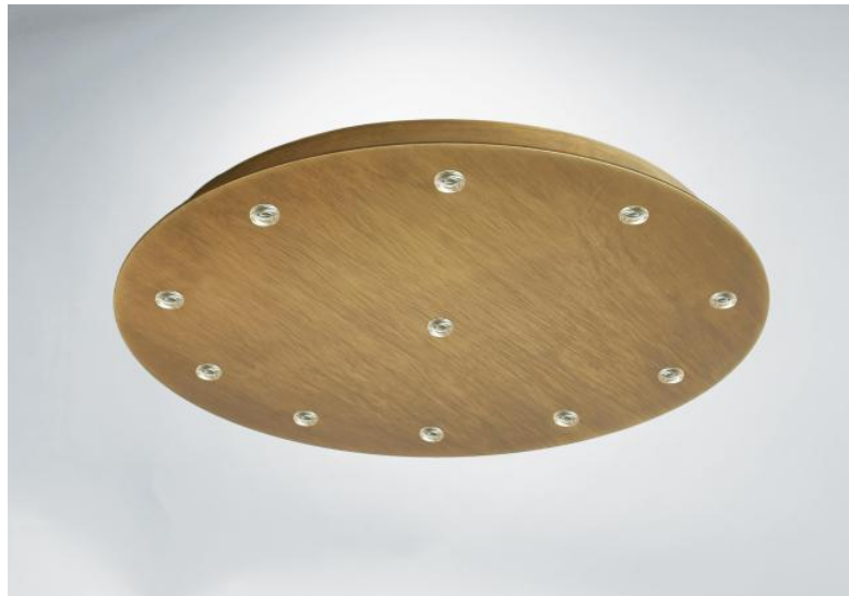
CEILING BASE 11 o38 in light bronze. Metal finish code: 28. Optional: a wide choice of cables and fittings (+supplement)