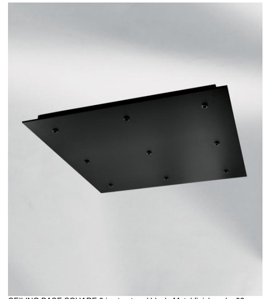
CEILING BASE SQUARE 9 in structured black. Metal finish code: 02. Optional: a wide choice of cables and fittings (+supplement)