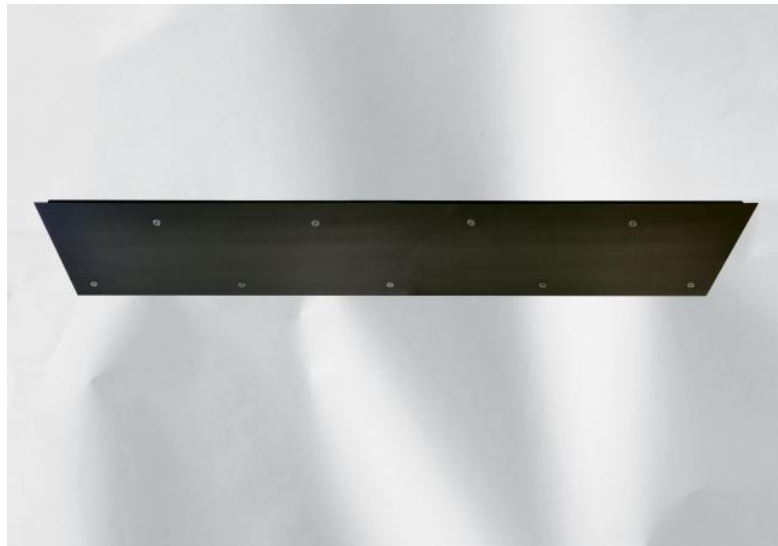
CEILING BASE 9 # in brushed bronze. Metal finish code: 29. Optional: a wide choice of cables and fittings (+supplement)