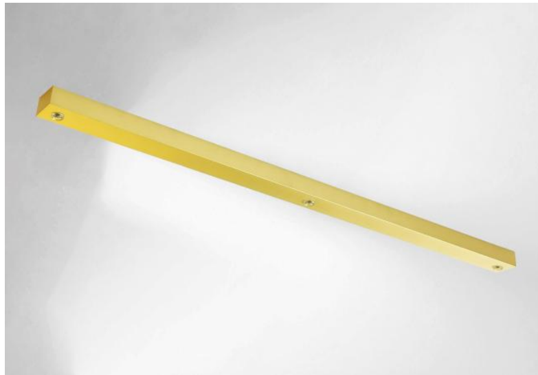
CEILING BASE L 3 in brushed brass (option). Metal finish code: 25. Optional: a wide choice of cables and fittings (+supplement)