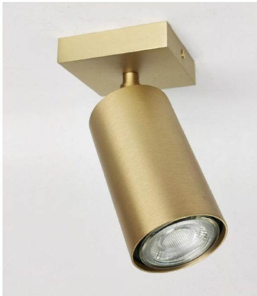
DEIMOS S1 # in brushed brass. Metal finish code: 25