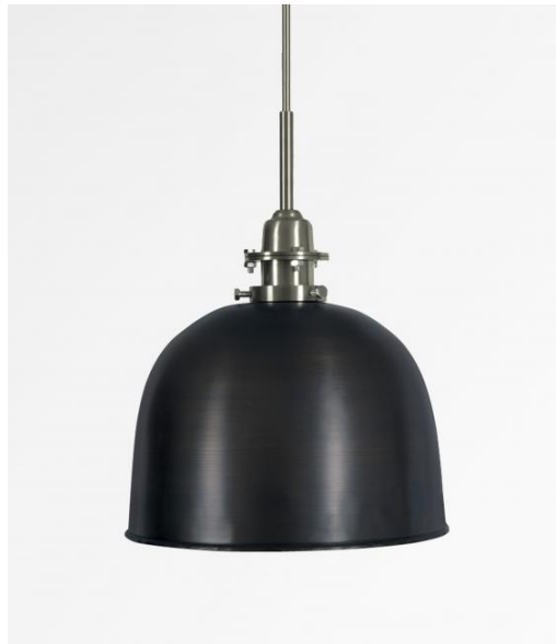
SUPERNOVA in brushed bronze and brushed nickel (code 93)