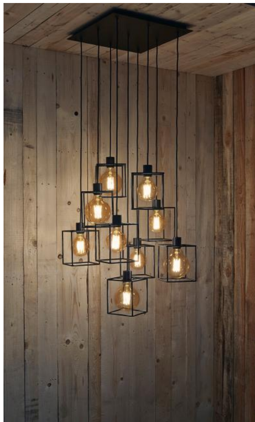
KERMA SQUARE 9 in brushed bronze with structures in black epoxy