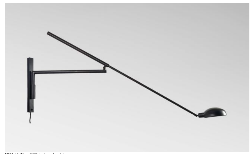
POLLUX + SW in brushed bronze