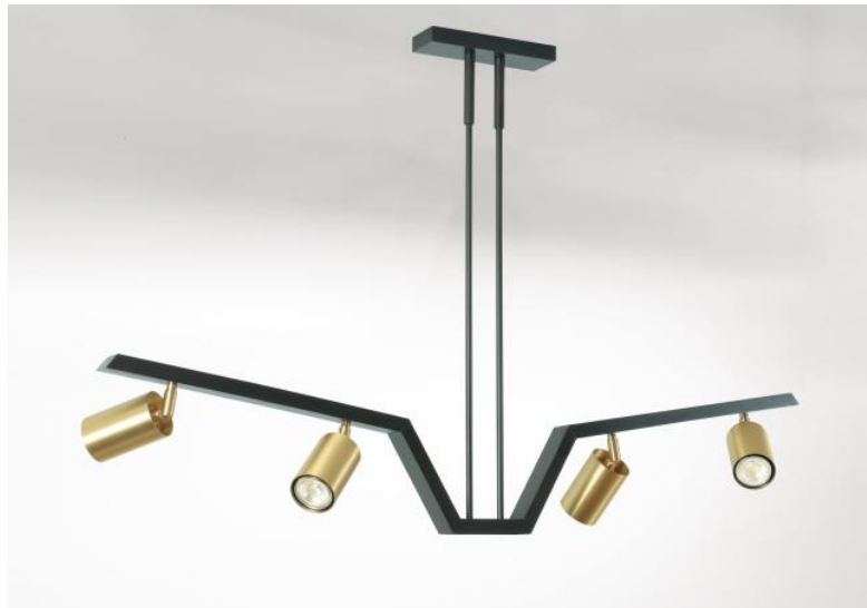
ALBATROS in brushed bronze and brushed brass. Metal finish code: 95