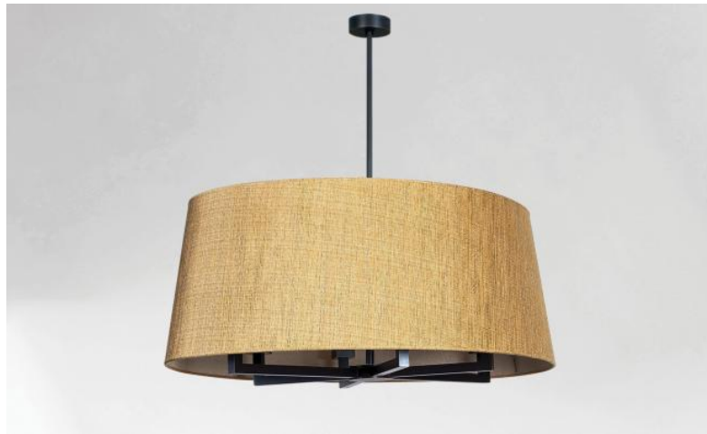
TOURAH 6 OVALE in brushed bronze with oval lampshade L90cm in Turda Abricot (fabric from category 3)