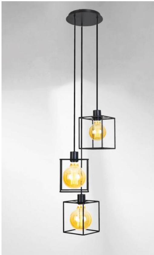
KERMA 3 o20 in brushed bronze with structures in black epoxy