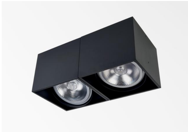
ATRIA 2 MOBILE in structured black. Metal finish code: 02