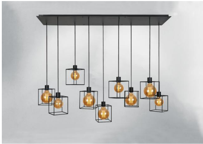
KERMA 9 # in brushed bronze with structures in black epoxy