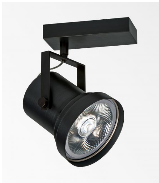
ATHENA 1 in brushed bronze