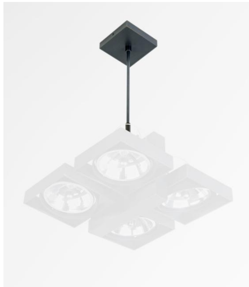
SARGAS 4 mounted on a SARGAS 4 SUSPENSION