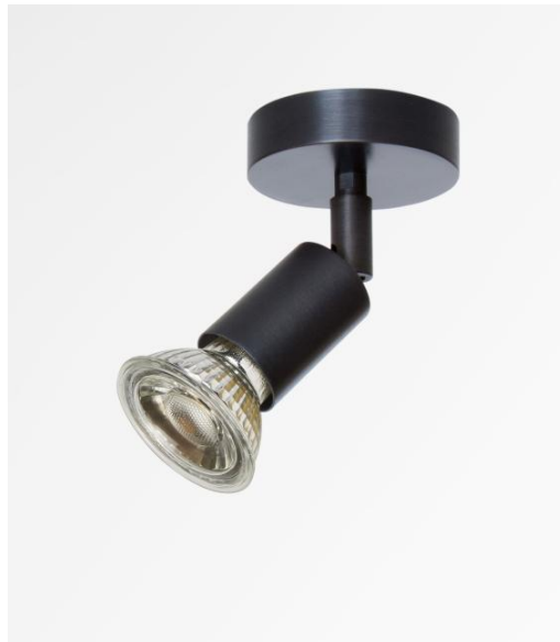
MERCURE ST in brushed bronze. Metal finish code: 29