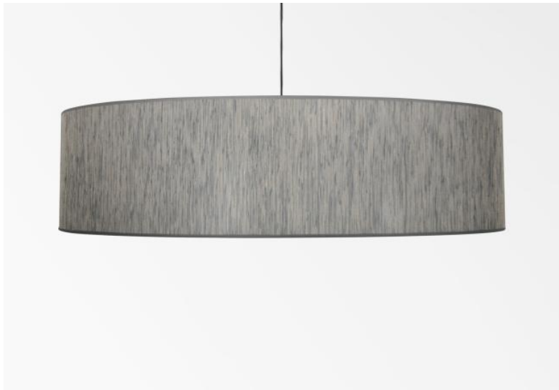
Lampshade KENTIKA 80 SHORT in Vérone (fabric from category 3)