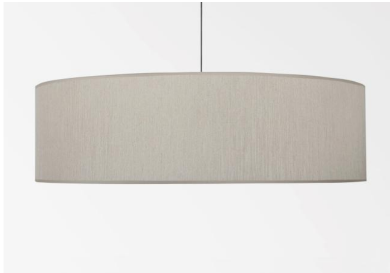
Lampshade KENTIKA 70 SHORT in Crémone (fabric from category 3)